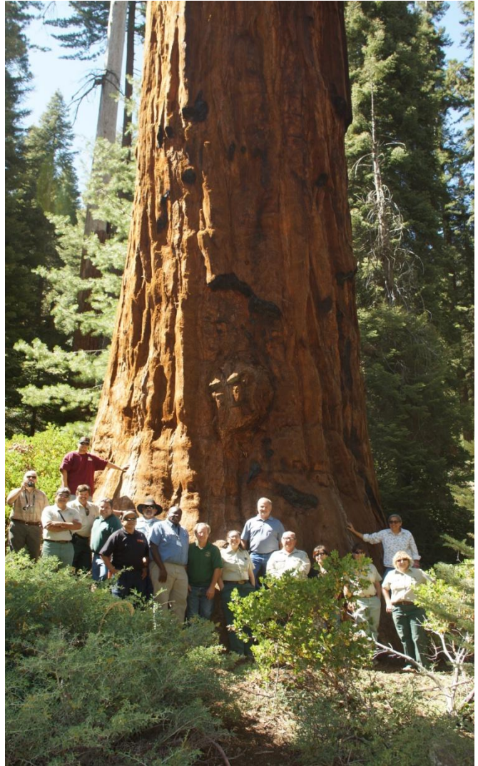
Sequoia NF –Tule River Reservation Site Visit July, 2012