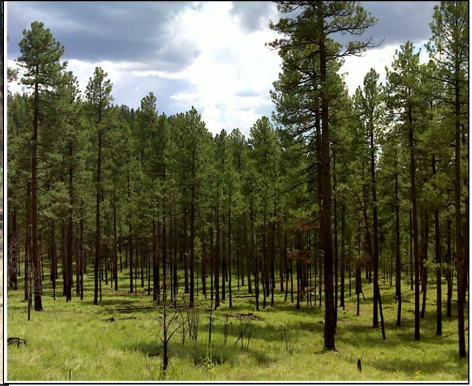
Wallow fire: an under-burned ponderosa pine forest on the Fort Apache Indian Reservation impedes fire advance.