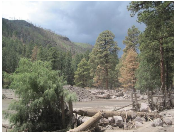
The TFPA can address hazardous conditions for wildfire which could damage lands and resources of concern to Indian Tribes. A series of three wildfires that originated on Forest Service lands affected the headwaters of Santa Clara Creek and contributed to severe monsoonal flooding, extreme erosion of the stream channel and sedimentation of water retention and fishing ponds of the Santa Clara Pueblo Tribe. July 2012.

Volume II contains several appendices that support and supplement Volume I: (A) the TFPA; (B) results of online surveys; (C) success stories; (D) site visit reports; (E) proposed training modules; (F) reference materials pertinent to TFPA implementation; and the (G) methodology used to conduct the investigation.