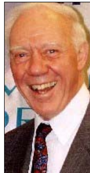
Rep. James Oberstar