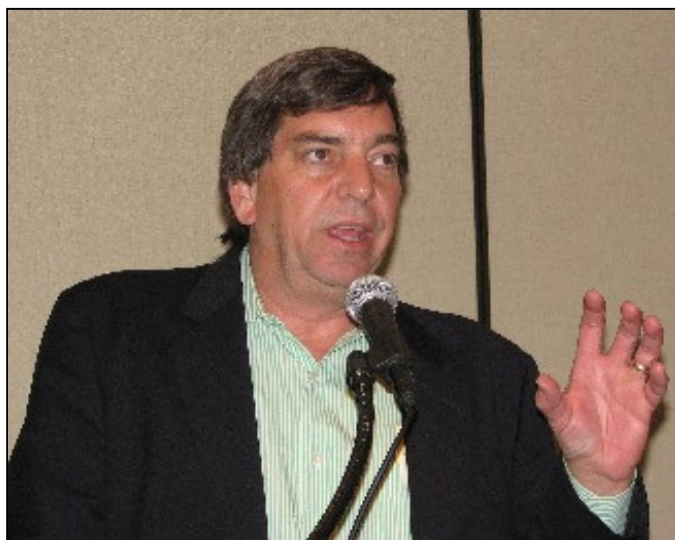
Family Farm Alliance